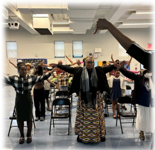
Parent and Child Nutrition Workshop