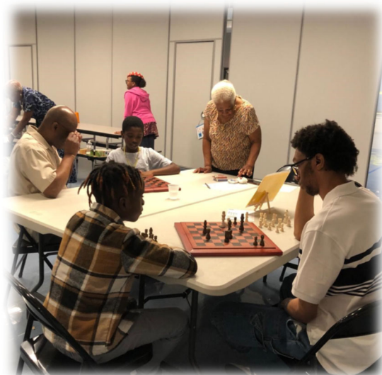
Parent & Child Fun Games and Painting